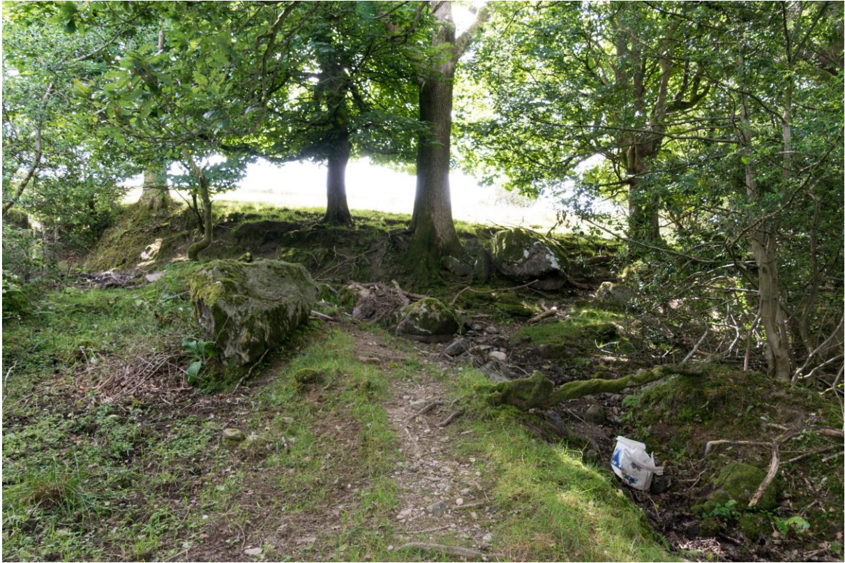
Definitive line passes somewhere through these boulders and watercourse