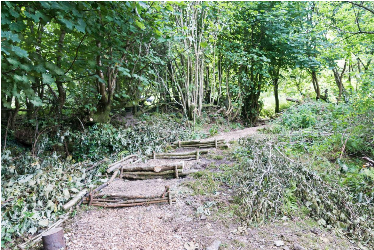
Along the new path being created by landowner / applicant