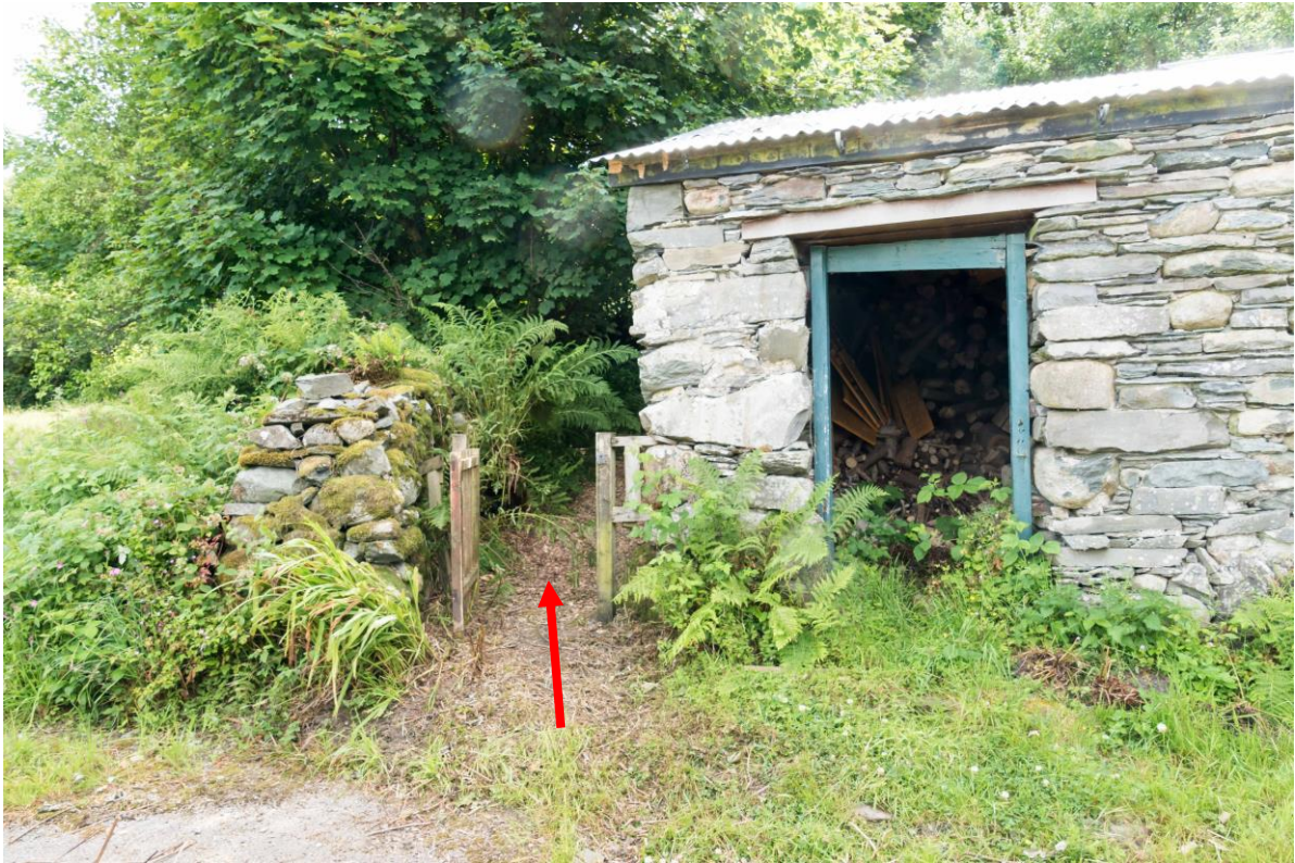
The new path will go through gate